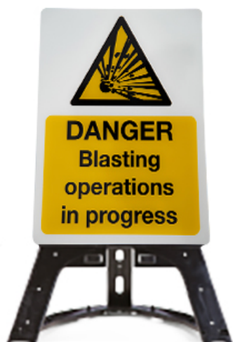
Image is illustrative, Blasting sign is not included